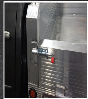
Drop Down Sides with Spring-loaded Latches