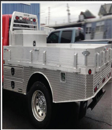
Custom Skirted Flatbed with Sideboards and Toolboxes

For more information, visit DuraMagTruckBodies.com