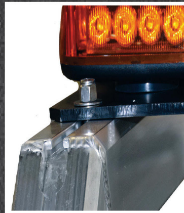
Integrated Accessory Track Headboard