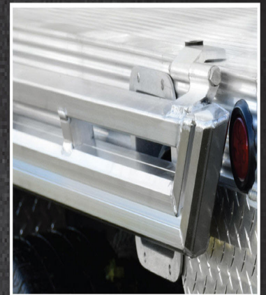
Optional Extruded Aluminum Fold Down Rails with Accessory Track