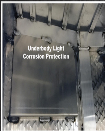
Underbody Light Corrosion Protection

For more information, visit DuraMagTruckBodies.com