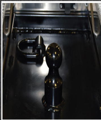
Integrated Gooseneck Ball with D-Rings & 7-Way Plug