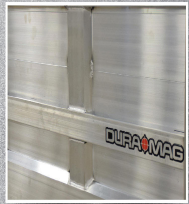
Optional HD Tie Rail