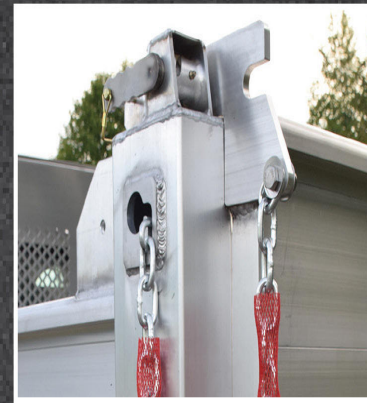
Heavy Duty Corner Posts