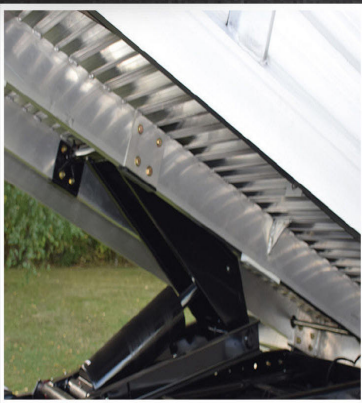
Cross Member-less floor for Lower Center of Gravity

For more information, visit DuraMagTruckBodies.com