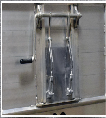
Optional Coal Chute