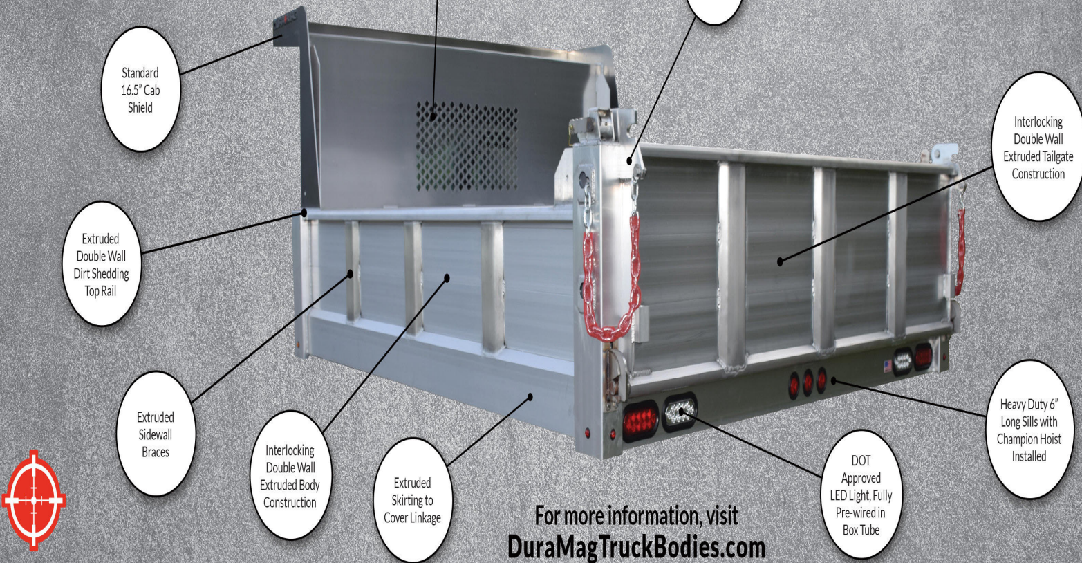
Standard 16.5" Cab Shield