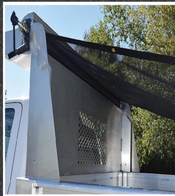
Optional Manual Tarp