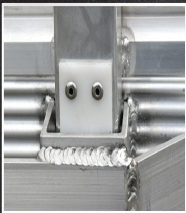
HDPE Strips Reduce Chaffing and Noise