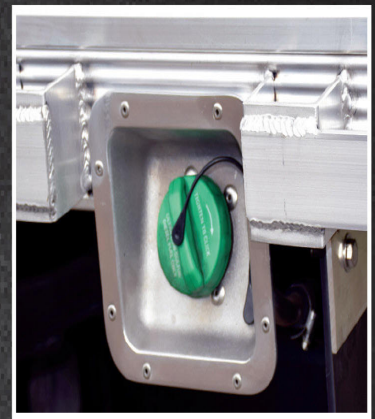
Optional Cast Fuel Filler